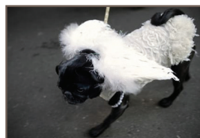
ANGEL PUG 1 Laurent Guérin (2010) 1/9 - 31" H x 44" W - Photography