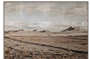
28.41°N - 13°W Laurent Guérin (2010) 1/9 - 30" H x 79" W - Photography