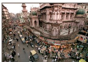
MINARA FULL Laurent Guérin (2008) 2/9 - 30" H x 44.5" W - Photography