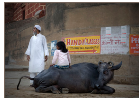
UNTITLED (hindi classes) Laurent Guérin (2008) 2/9 - 22" H x 27.5" W - Photography