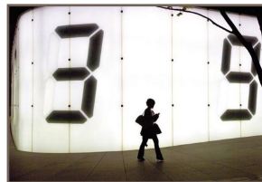
COUNTER VOID 2 Laurent Guérin (2006) 1/9 - 40" H x 60" W - Photography