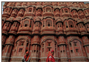
HAREM Laurent Guérin (2008) 4/9 - 22" H x 28" W - Photography