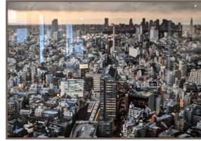
35°38' N - 139°42' W, TOKYO Laurent Guérin (2009) 1/9 - 30.5" H x 46" W - Photography