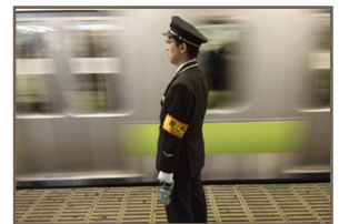
UNTITLED (Silver and Green) Laurent Guérin (2006) 4/6 - 26.5" H x 40" W - Photography