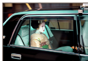
GEISHA Laurent Guérin (2008) 2/6 - 26.5" H x 39.5" W - Photography