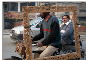
UNTITLED (miroir) Laurent Guérin (2008) 1/9 - 30" H x 40" W - Photography