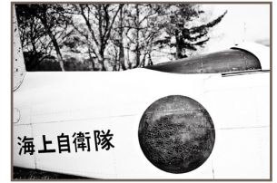
HINOMARU Laurent Guérin (2008) 5/9 - 30" H x 45" W - Photography