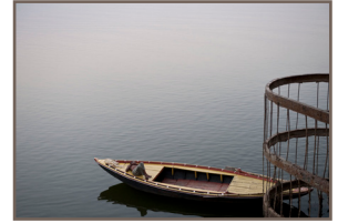
UNTITLED (dormeur canot) Laurent Guérin (2008) 4/9 - 26" H x 39" W - Photography