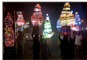
FILLES LANTERNES Laurent Guérin (2008) 1/9 - 27" H x 40" W - Photography