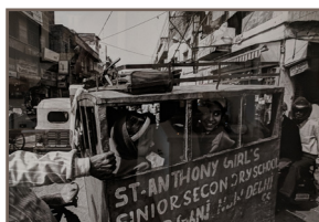
SCHOOL BUS Laurent Guérin (2010) 1/9 - 21" H x 32" W - Photography