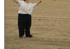
CONEY ISLAND Laurent Guérin (2008) 1/9 - 39.5" H x 26.5" W - Photography