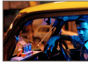
TAXI Laurent Guérin (2008) 4/9 - 26.5" H x 40" W - Photography