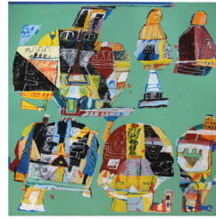
Kept Up - 2019 24" x 24" Acrylic and acrylic spray on board