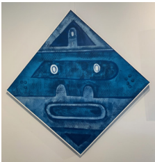
Left Ear - 2019 36" x 36" Spray paint and acrylic on board