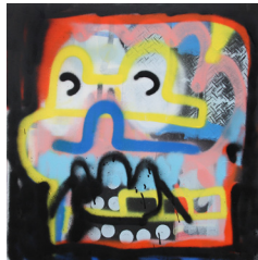
Xamot - 2019 24" x 24" Spray paint and acrylic on canvas