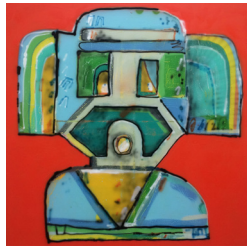
Mogwe - 2018 31" x 31" Acrylic and acrylic spray paint on canvas